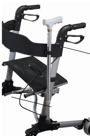
Bandage to fix umbrella or cane